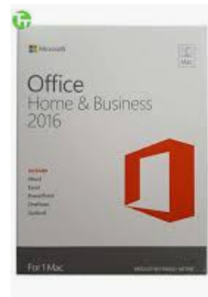
Microsoft Office 2016 Pr indonesian.softwaresoem.