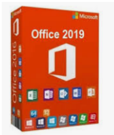
Presale Microsoft Office 20... computer-software.com

CRACK MS Office 2016 Pro Plus VL X64 MULTI-22 SEP 2018 {Gen2}