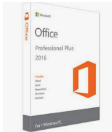
Windows and Office Serial ... mskeystore.blogspot.com